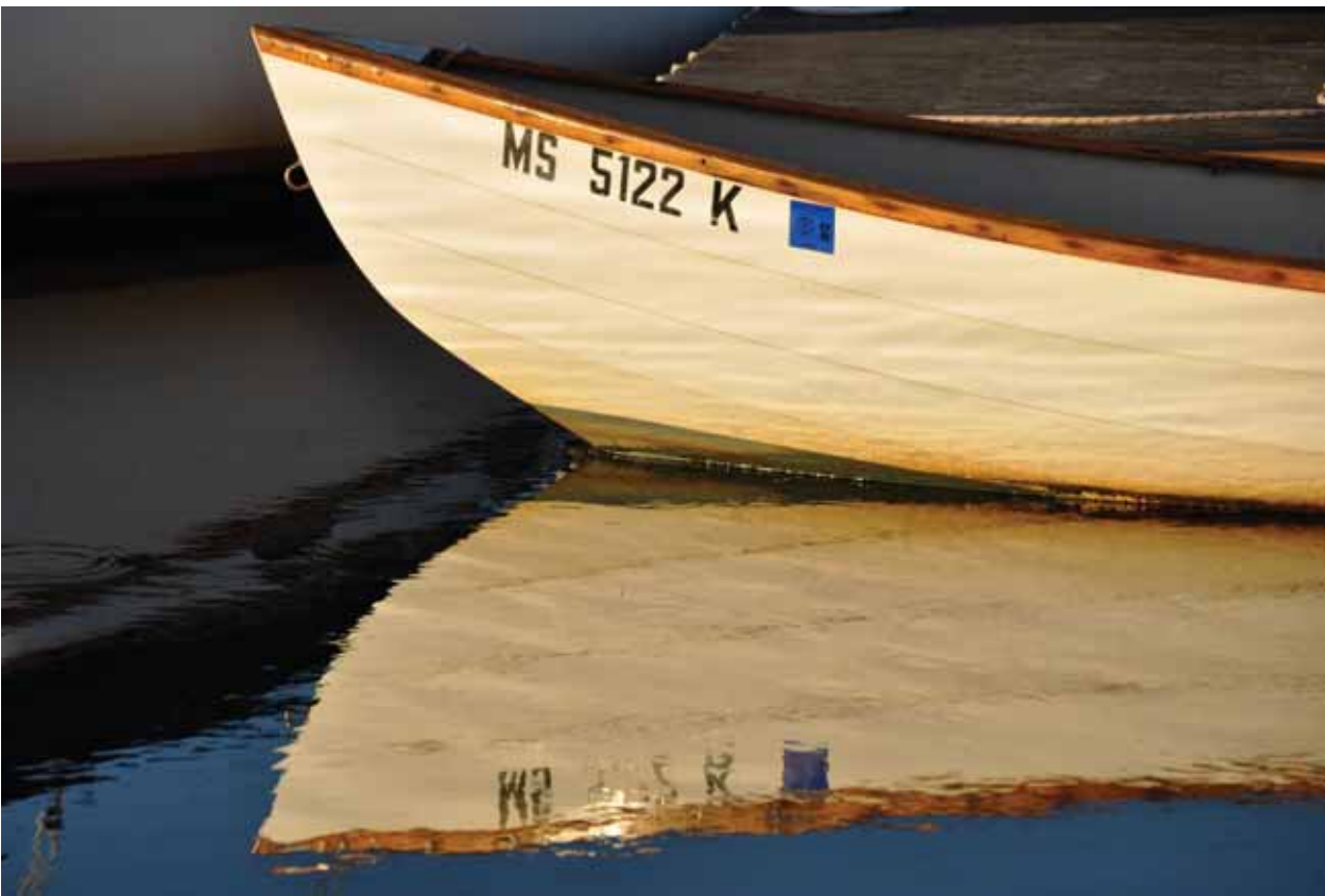
Left: A dory, awaiting the day, is reflected in the calm water of Chatham's Oyster River. Below: The strong outlines of several of the remaining beach camps along Chatham's North Beach are framed against the sunset.