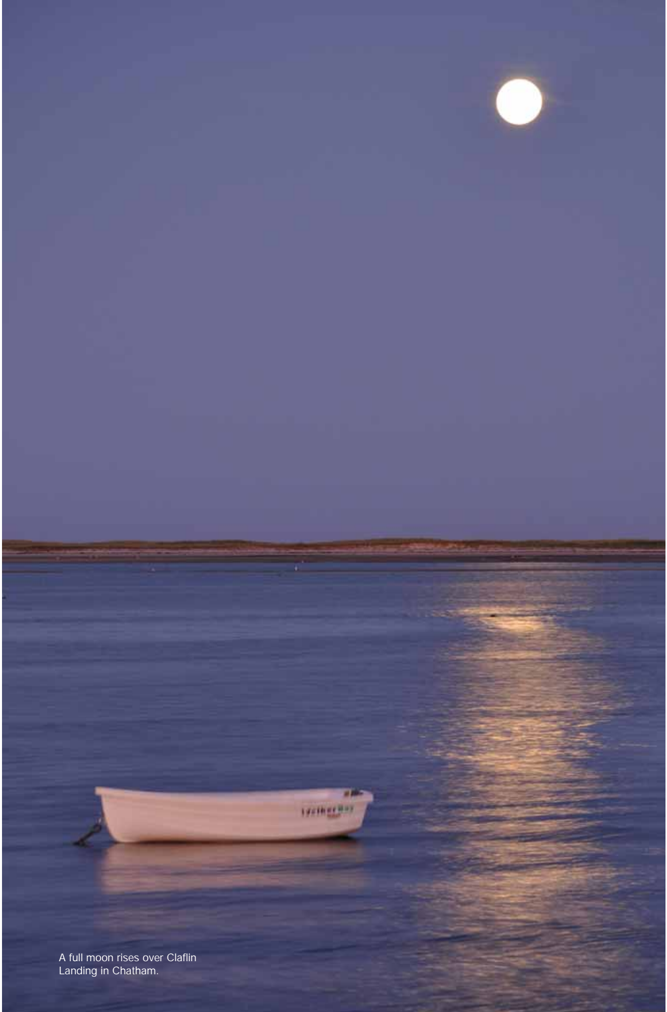
A full moon rises over Clafin Landing in Chatham.