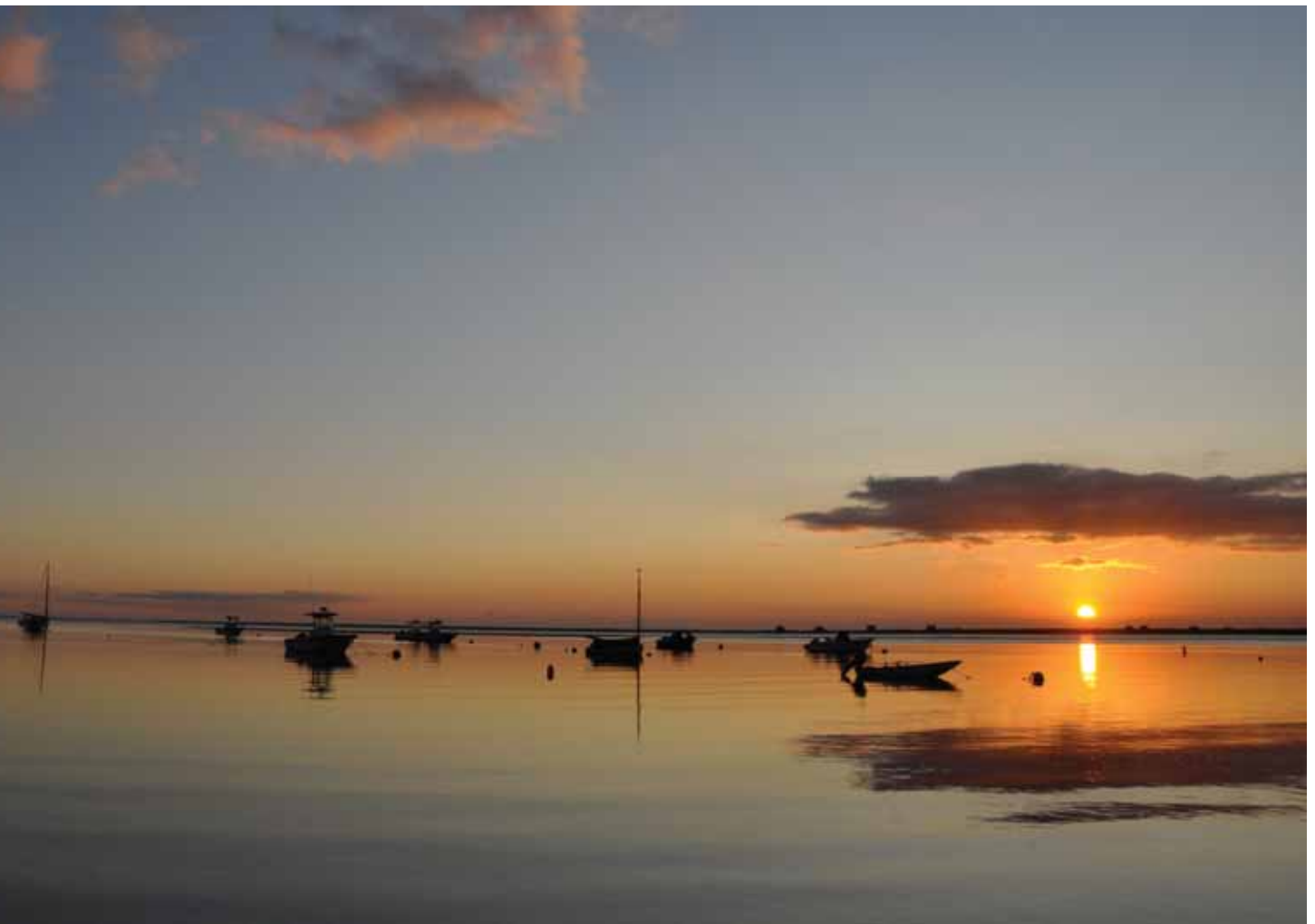
Above: Dawn breaks in vivid color over North Chatham. Right: North Chatham's still waters shortly before the town awakens.